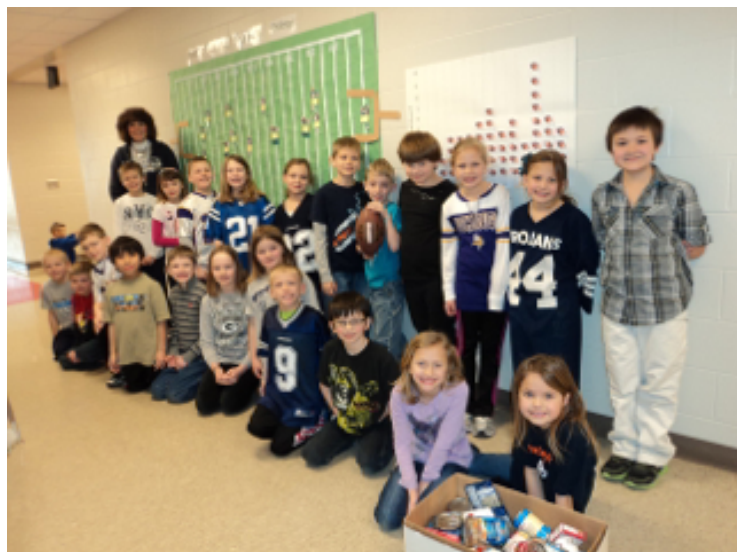
2B - Winners of the Souper Bowl Challenge!